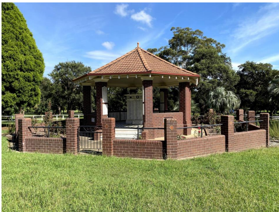
Concord Pavilion of Honour